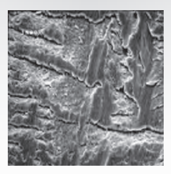
The bearing is scuffed after using a leading synthetic motor oil.